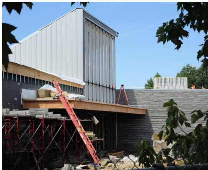
A view to the future: Looking at the new Bainbridge Branch from the grounds of the old Bainbridge Branch.

While state of the art in design and technological capacities, our new buildings also present us with an opportunity to offer our community new ways to engage and connect.