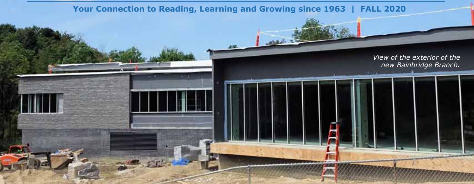
View of the exterior of the new Bainbridge Branch.

Your Connection to Reading, Learning and Growing since 1963 | FALL 2020