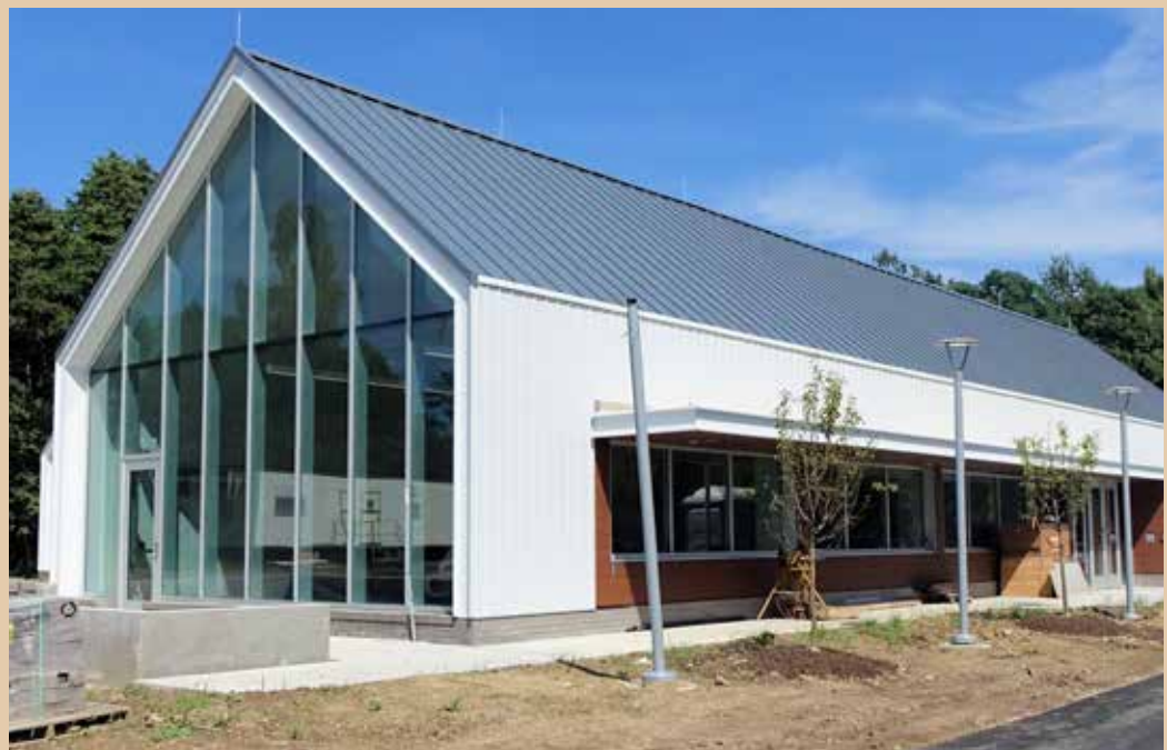
Front and side exterior of the new Thompson Branch.

For details on the features at each building and more pictures please see pgs. 4 - 5.