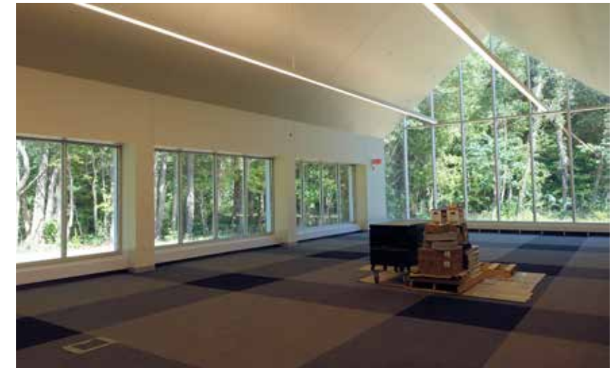
"Once there was a tree..." Interior view from the new Thompson Branch.

Thank you, Geauga County, for your support, insight, and enthusiasm. We are thrilled to offer these new buildings and services to you. #GCPLBuilds