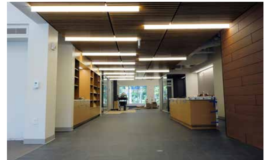
We are so excited about the open feel and light at our new Thompson Branch.