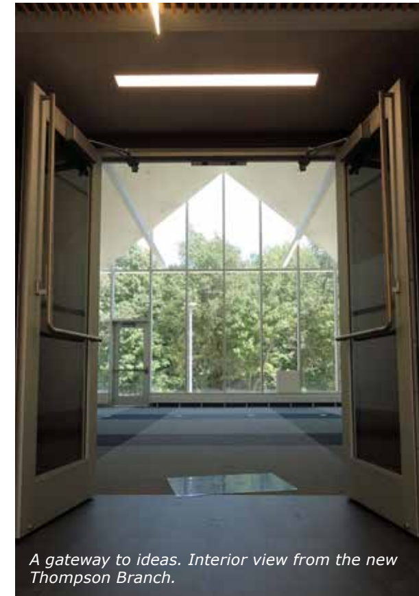
A gateway to ideas. Interior view from the new Thompson Branch.