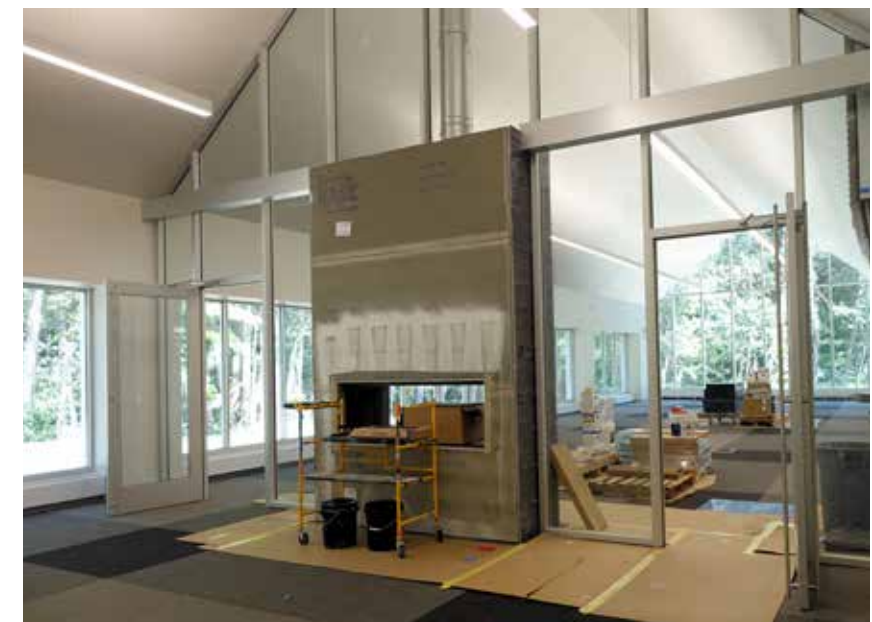
Who doesn't love to read beside the fireplace? Here is a glimpse of Thompson's.