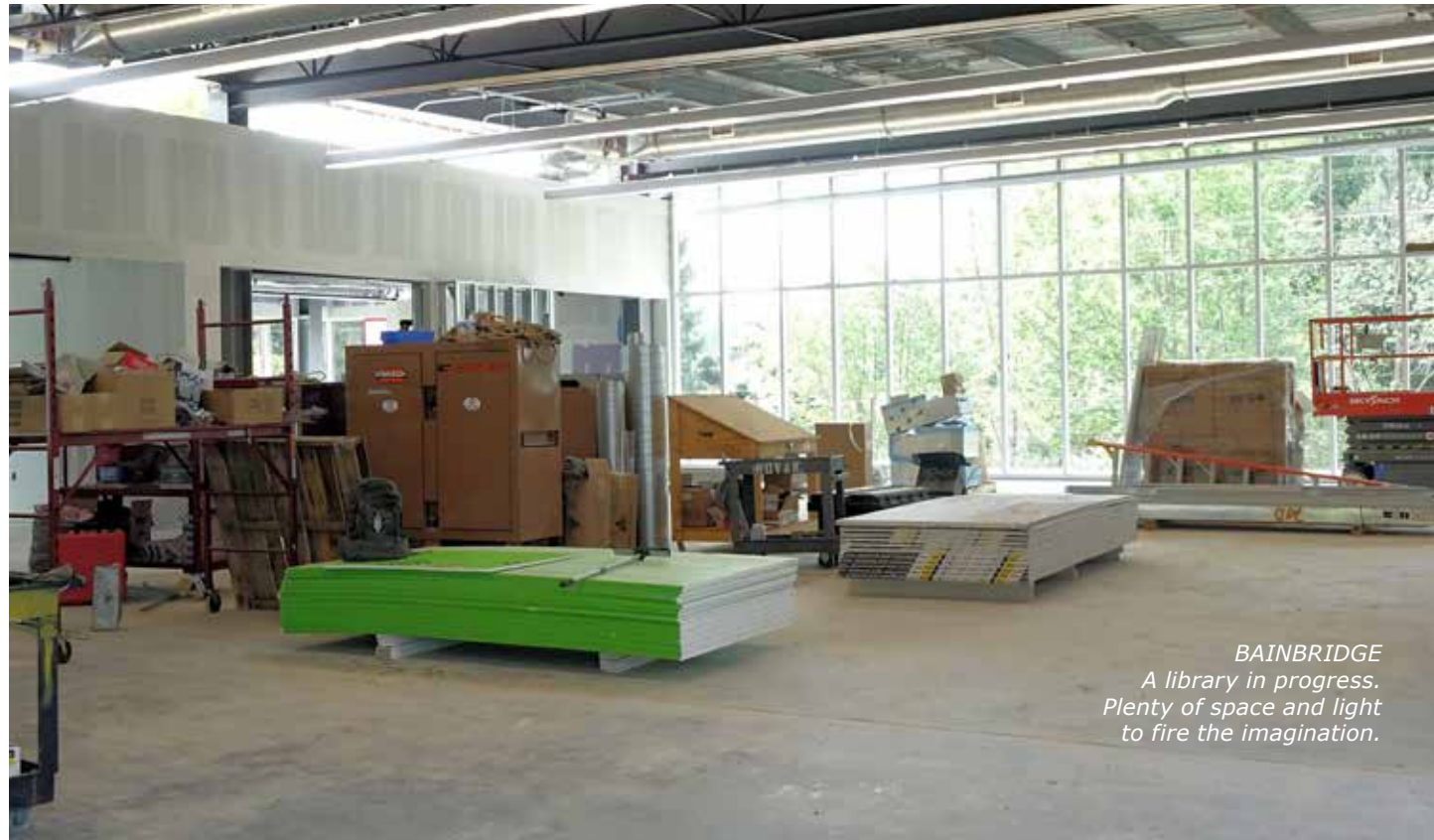
BAINBRIDGE A library in progress. Plenty of space and light to fire the imagination.